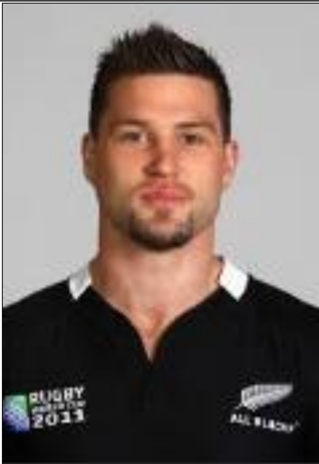
(Reference Goggle Images Cory Jane Wikipedia the free encyclopedia)