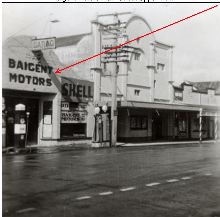
(Reference Upper Hutt City Library Recollect website Main Street Baigent Motors 1948 Sylvia Williams collection)