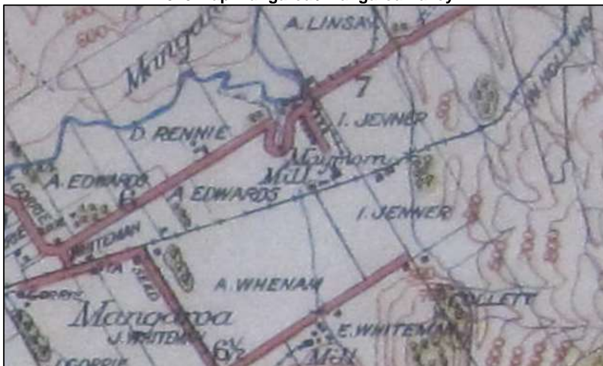
(Reference Map of Manoeuvre Area Neighbourhood of Trentham Camp Wellington 1915 IMG_4590.JPG)