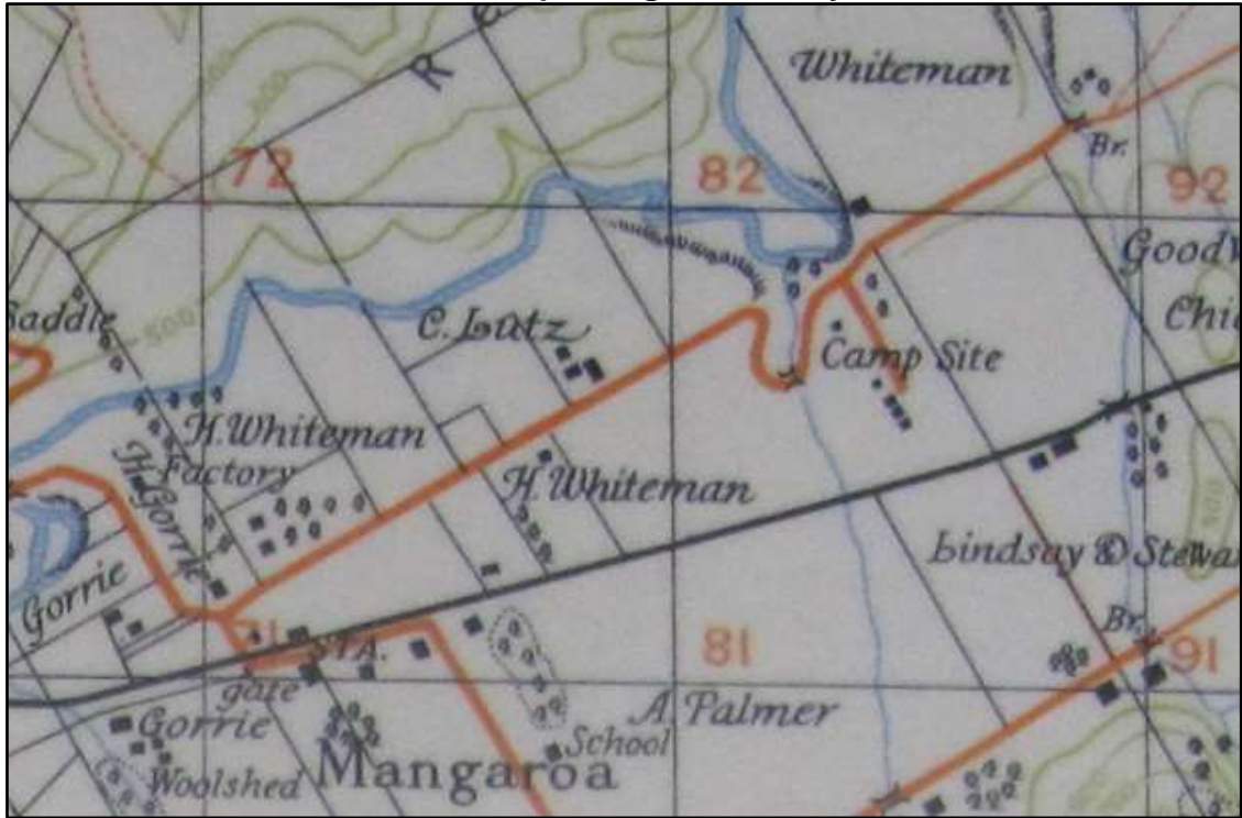
(Reference Trentham Manoeuver Area Map 1929 IMG_4599.JPG)