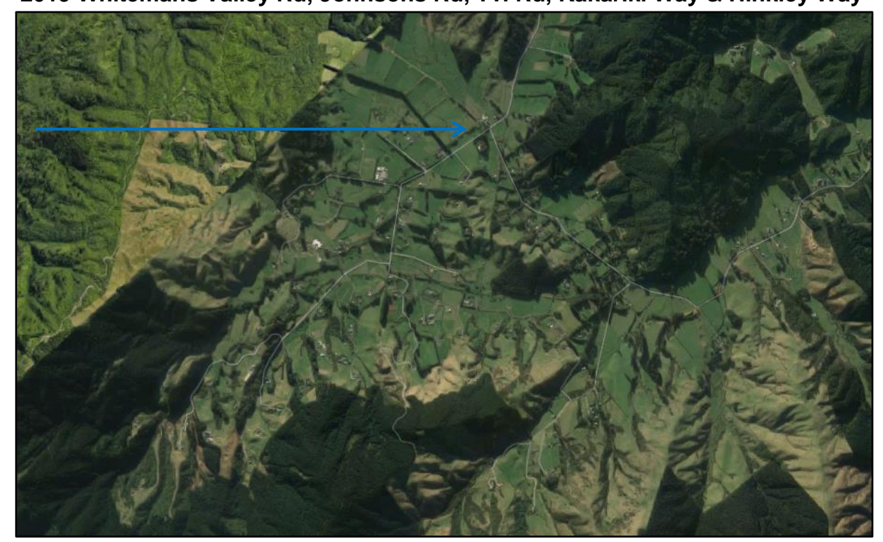
(Reference Google Maps Whitemans Valley Road Johnsons Road, Tvl Road, Kakariki Way & Hinkley Way