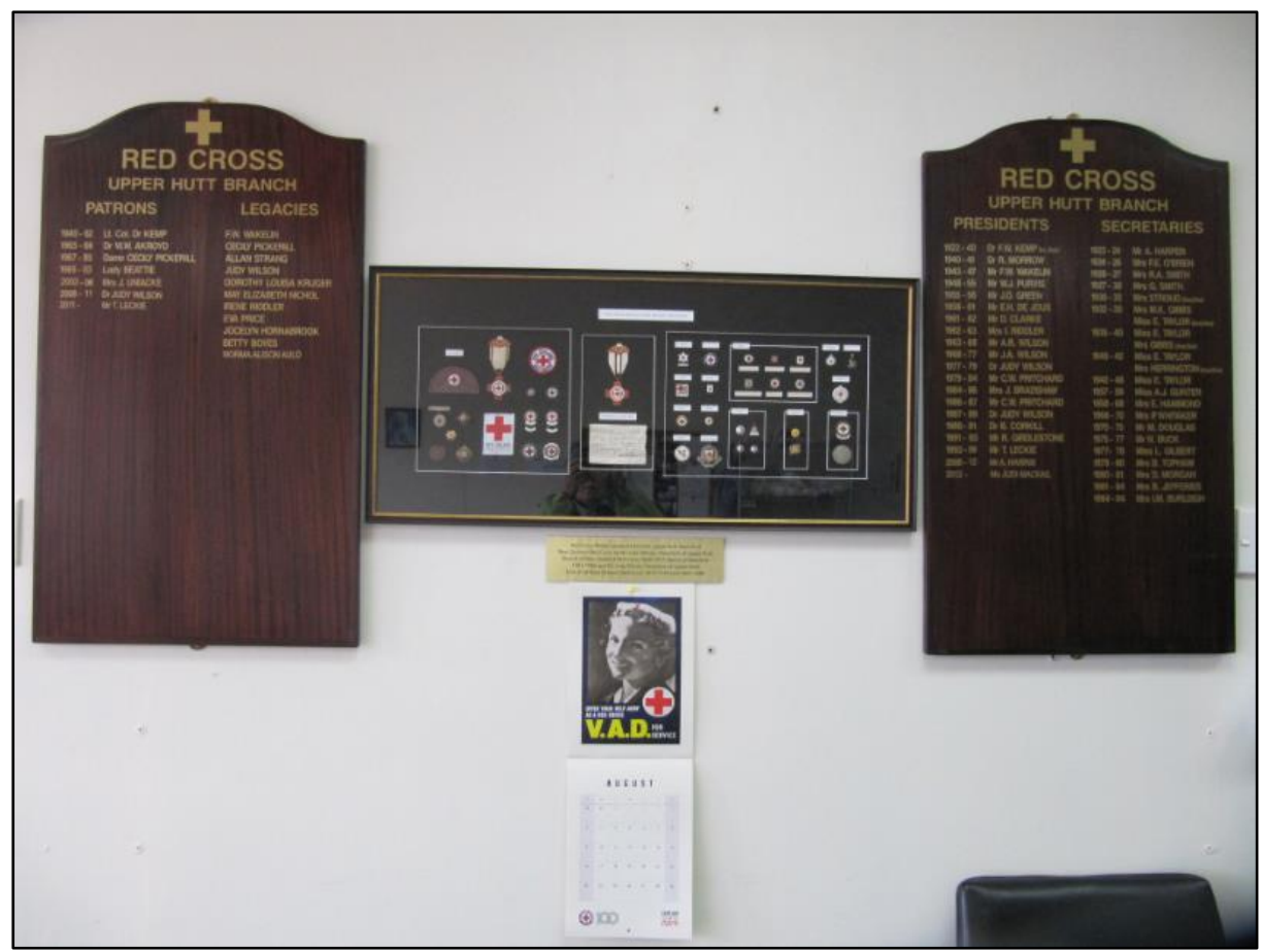
(Reference private saved as Red Cross UHHonoursBoard&Display=IMG_1707.jpg)