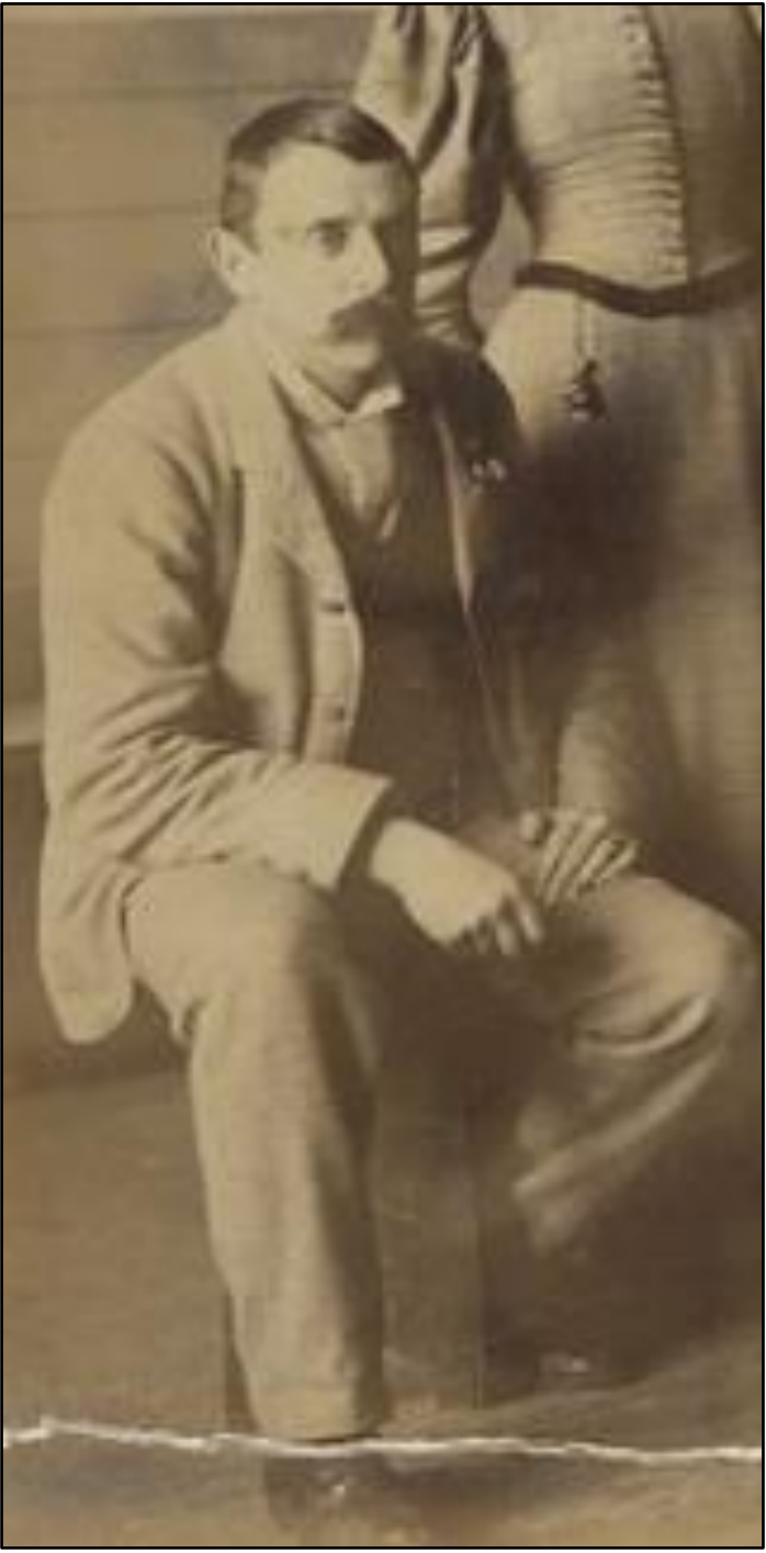
(Reference UH City Recollect website Pumpkin Cottage Silverstream P49-1-5) James Nairn

James Nairn Grove was named after James Nairn who was the founder of the Art school at Pumpkin Cottage in Silverstream. Around 1894 onwards James attracted many well-known artists to the cottage. Artists were internationally recognized as having attended the Nairn School.