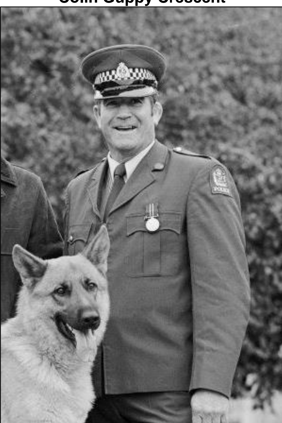
Colin Guppy Crescent