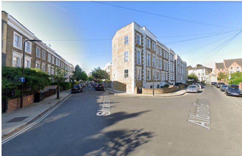
29 Albion Grove London once situated corner Shakespeare Walk & Albion Grove