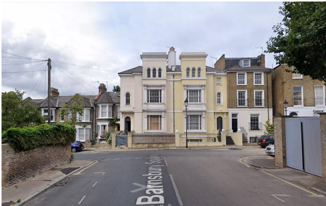
7 Barnsbury Terrace London is the cream dwelling at the end of the road on the right

(Reference Ancestry website London baptism 1862 St Mary Islington Middlesex England page 205 line 1635)