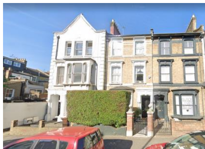
37 Rectory Road London is the dwelling in the middle with the high green hedge

(Reference Ancestry website 1881 Census 37 Rectory Road St John Hackney Ward West Hackney Borough Hackney London England ED 4 piece 288 folio 93 page 10 also FHC microfilm 1341062 Census 1881 Hackney London Middlesex)