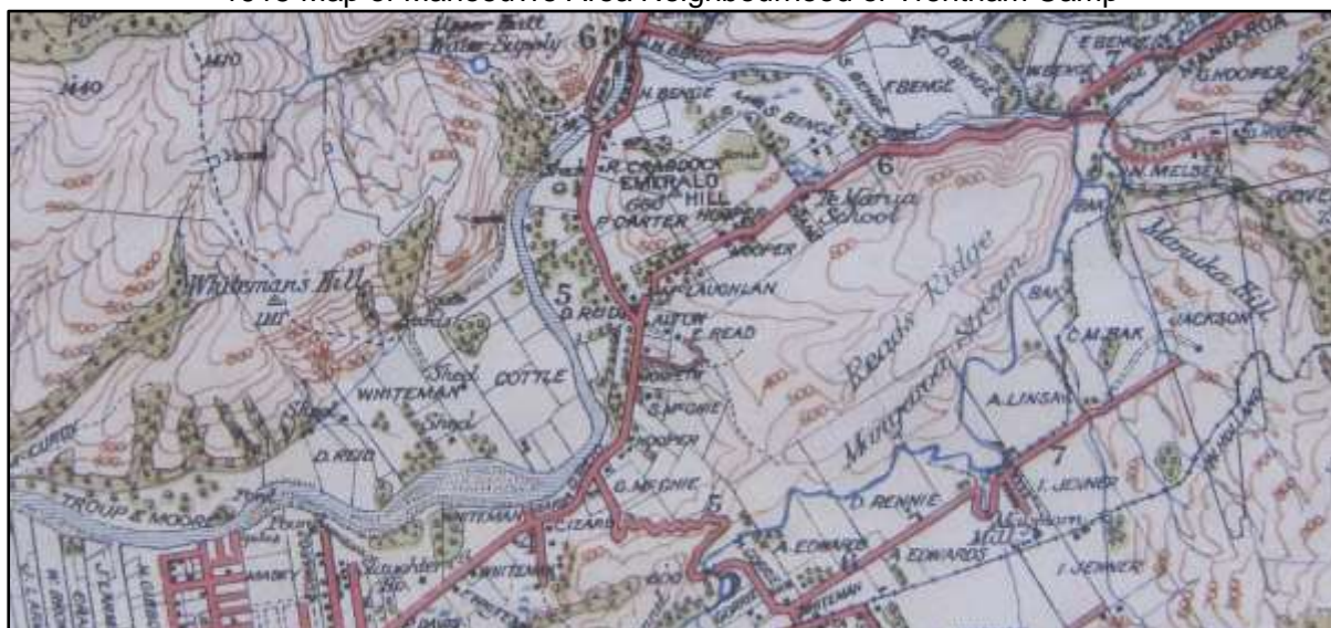
(Reference UH Map of Manoeuvre Area Neighbourhood of Trentham Camp 1915 IMG_4592.JPG)