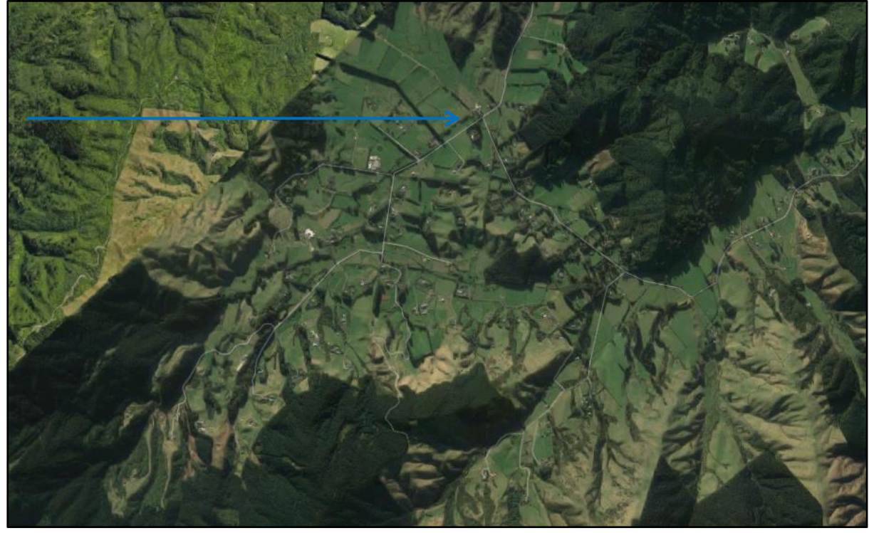
(Reference Google Maps Whitemans Valley Road Johnsons Road, Tvl Road, Kakariki Way & Hinkley Way