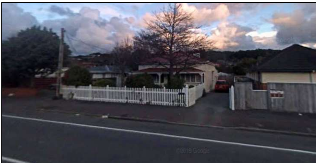
(2022 Google Maps website 238 Fergusson Drive Heretaunga 5018)

Situated opposite St Patricks College Silverstream