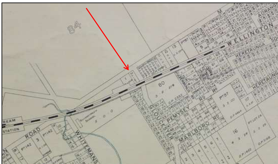
(Reference saved as UH Map 1927 DSCF5558.JPG)