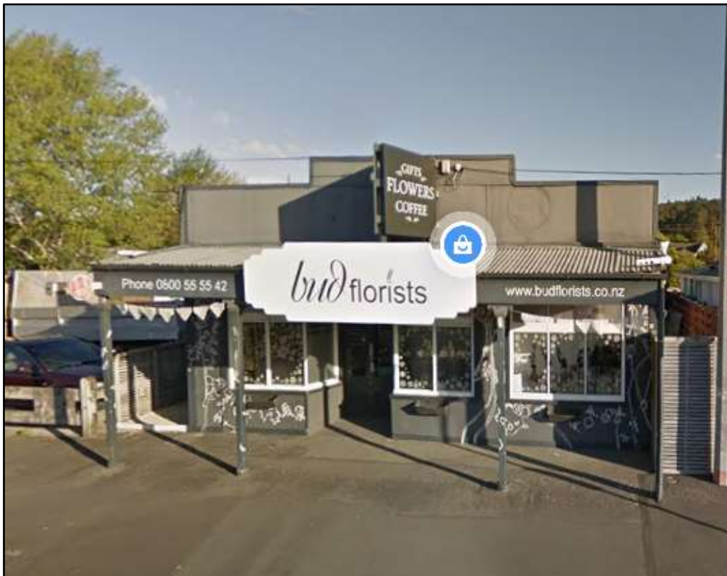
(2022 Google Maps website 238 Fergusson Drive Heretaunga 5018)

Situated opposite St Patricks College Silverstream