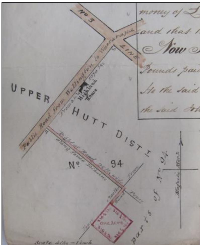
(Reference Archives NZ Wellington UH Section 94 IMG_3951)

(Reference Archives NZ Wellington AAYS 8708 AD100 2/dz MB1861/32 order large file MB1861/506)