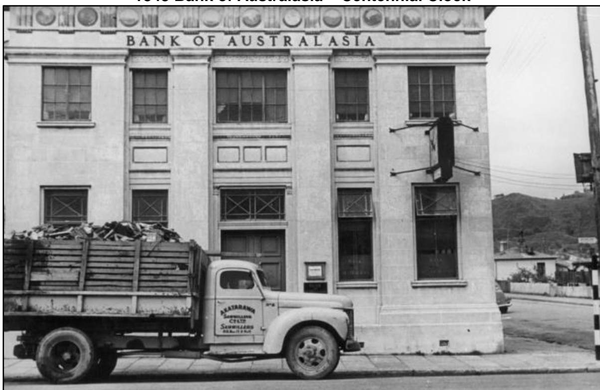
(Reference Upper Hutt City Council Recollect website Main Street Upper Hutt Jan 1848 Bank P3-396-1571)