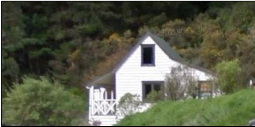
(Reference Goggle Maps website)