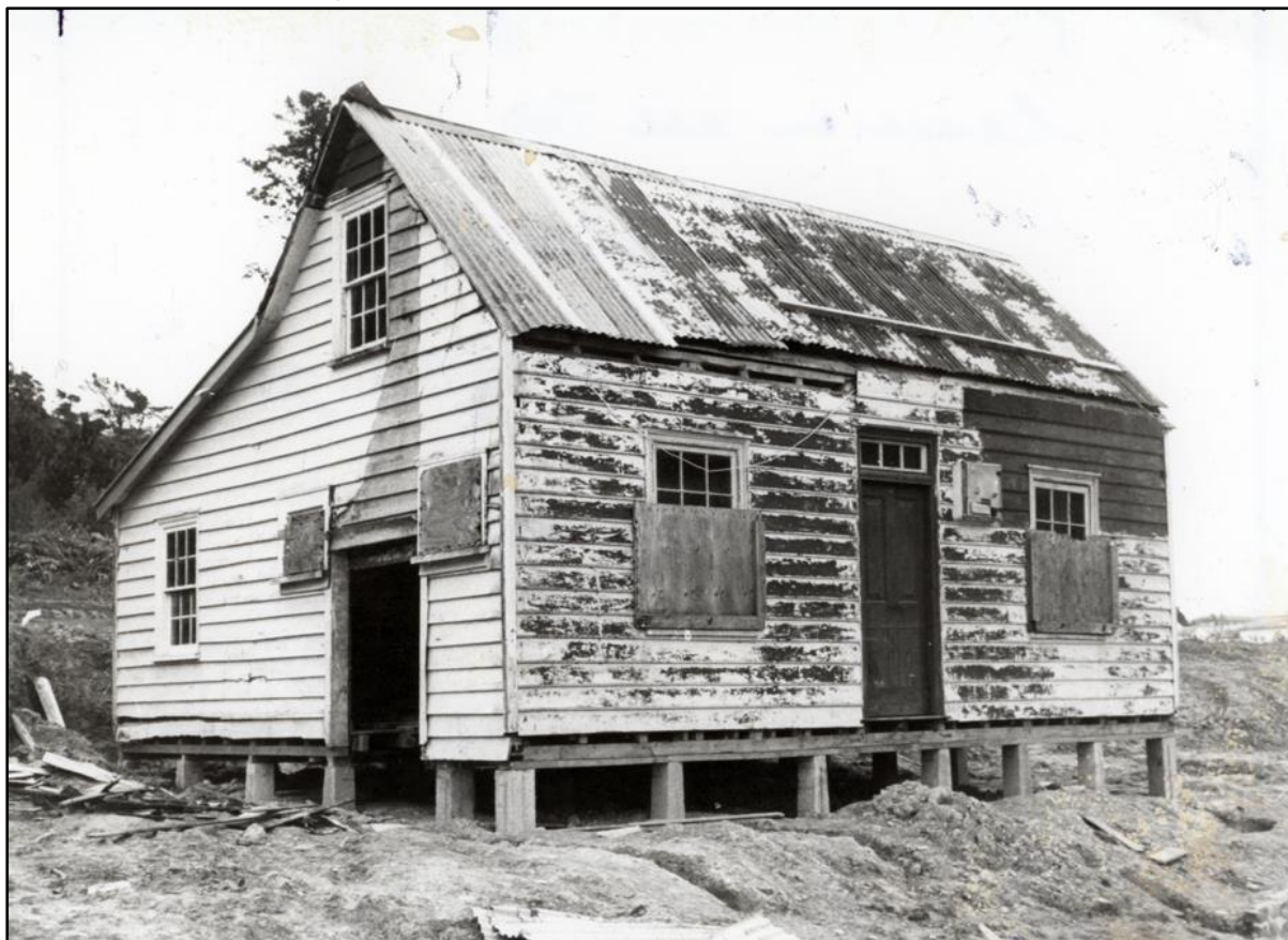
(Reference Upper Hutt City Library Recollect collection Upper Hutt Leader 07 July 1981)