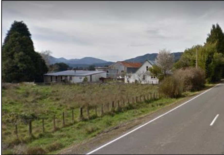
(Reference Goggle Maps view of Willowbank cottage 2022)