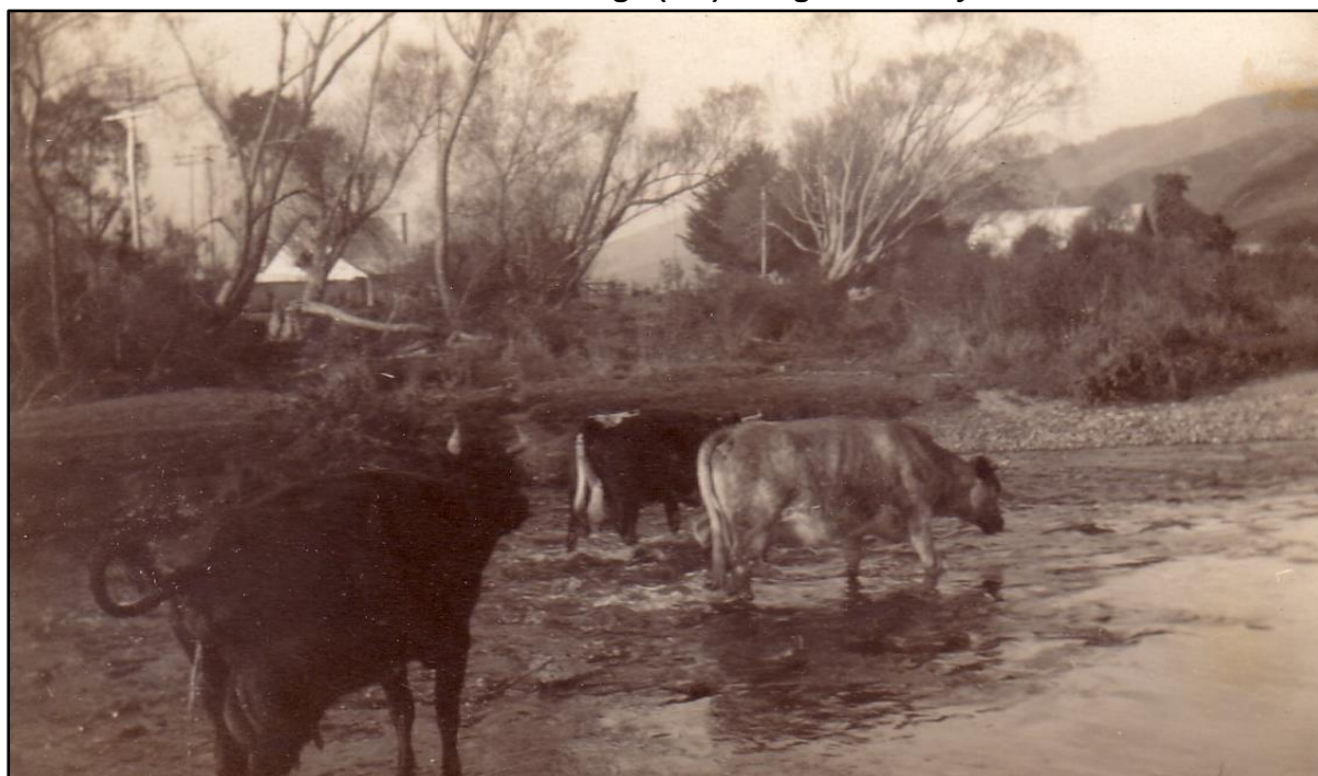
(Reference private collection UH BLD Willowbank & Sparrow Hall Wallaceville (1).jpg)