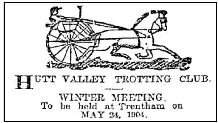
(Reference Papers past website New Zealand Times newspaper 14 May 1904)