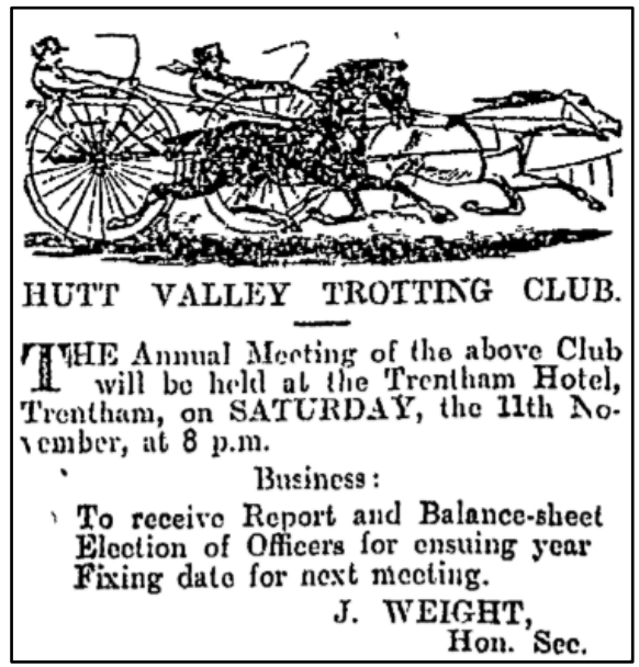
(Reference Papers past website Evening Post newspaper 09 November 1905)

(Reference Papers past website Evening Post newspaper 04 September 1905)