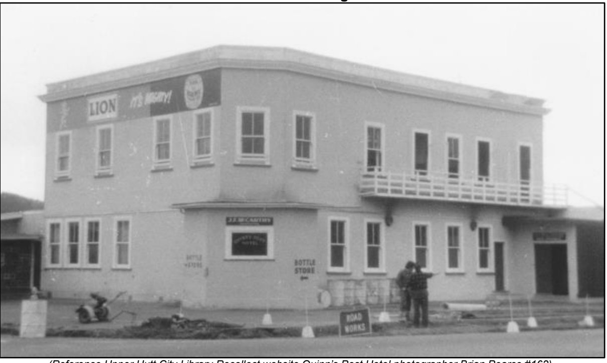
(Reference Upper Hutt City Library Recollect website Quinn's Post Hotel photographer Brian Pearce #162)