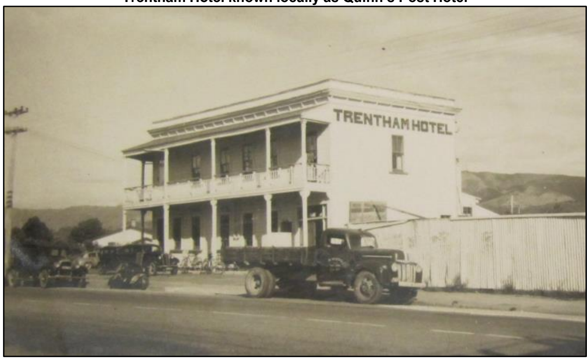
(Reference Archives NZ Wellington AADM W2874 678 box 78 a LCC/WEL saved as IMG_3180.jpg)

Trentham Hotel known locally as Quinn's Post Hotel