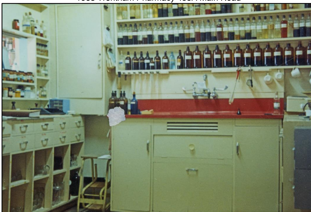
1963 Trentham Pharmacy 455A Main Road

(Reference Upper Hutt City Library Heritage Collection Recollect website 1963 Geraldine Simm collection)