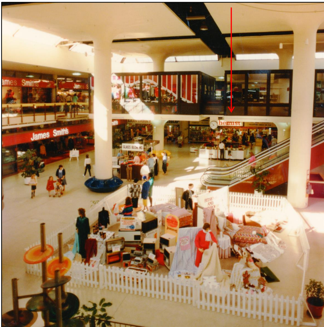
(Reference Upper Hutt City Library Heritage collection Recollect website I-site collection 1983)

It is not known when the Maidstone Mall Pharmacy closed.