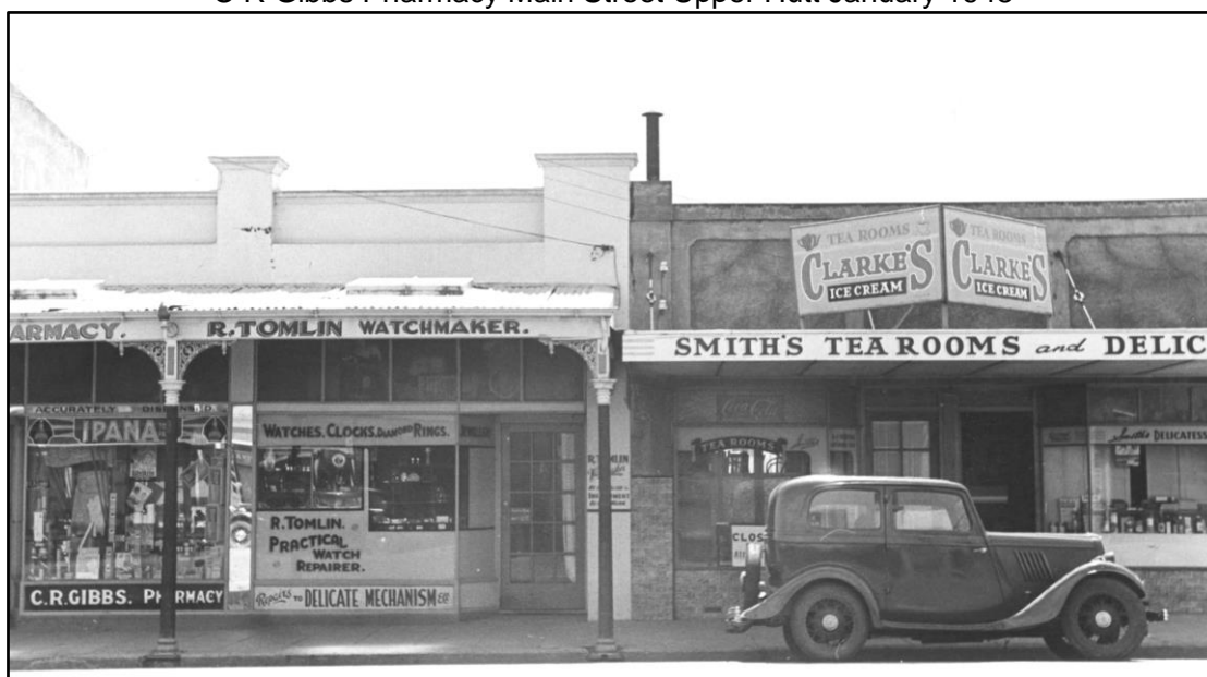
C R Gibbs Pharmacy Main Street Upper Hutt January 1948