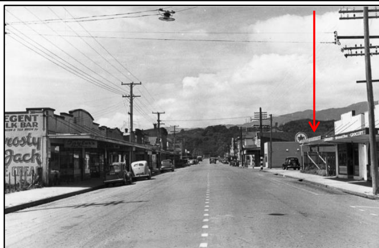
(Reference Upper Hutt City Library Recollect website Main Street c1948 from west end & Digital NZ reference Alexander Turnbull Library Main Street Upper Hutt ref 1/2-047849-G records/23181530)