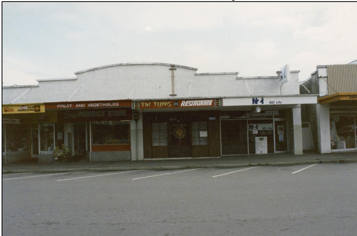
1989 Main Street Sue's Fruit and Vegetables