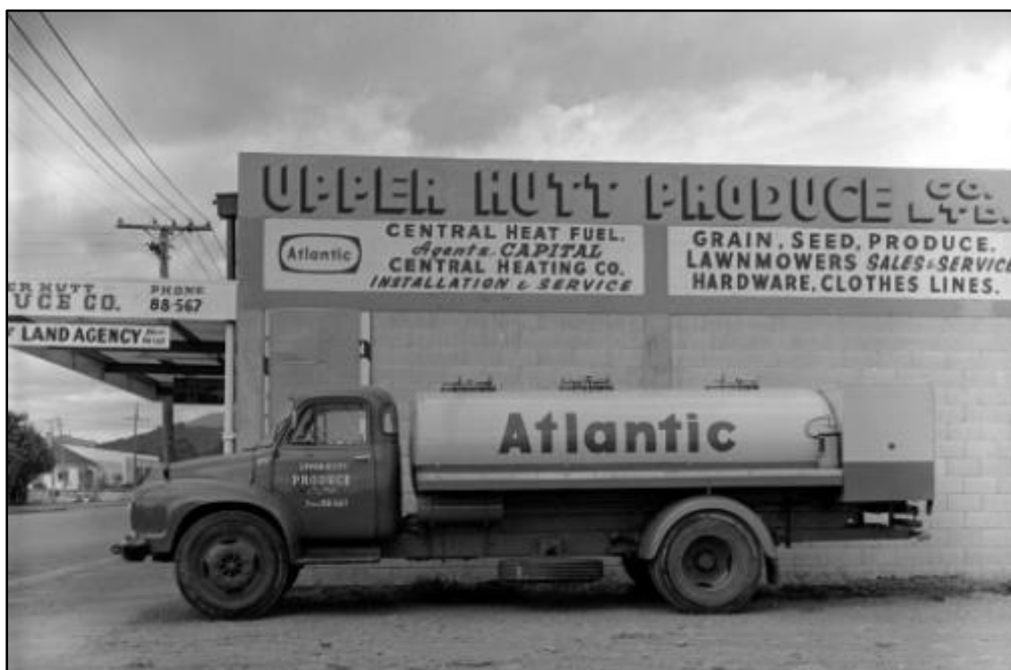
(Reference UH Library recollect website Queen Street No 18 Upper Hutt Produce Co Atlantic kerosene tanker P1-4505-6895)