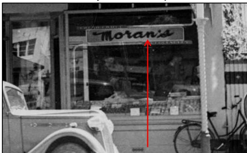
(Reference UH City Library recollect website Main Street Upper Hutt north side 07 Moran's photographer Leo Morel 1948)