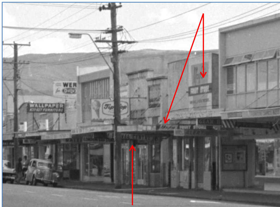
(Reference Upper Hutt City Library Recollect Main Street c1974 from Geange Street 1975_circa_Upper_Hutt_Main_St_013)

Last edited by Don McLeod – Description Photograph taken by Bill Wallace, who took a series of photographs along Main Street to keep record at time when things were changing, with the construction of Maidstone Mall. Last edited by Don McLeod - Date Taken ca. 1974