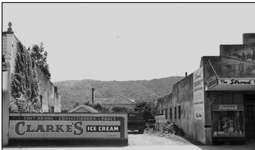
(Reference UH City Library Recollect website Main Street Jan 1948 North side 08 P2-165-601)

(blank section between neighbour Stroud's Furnishing at 113 & 111 Main Road)