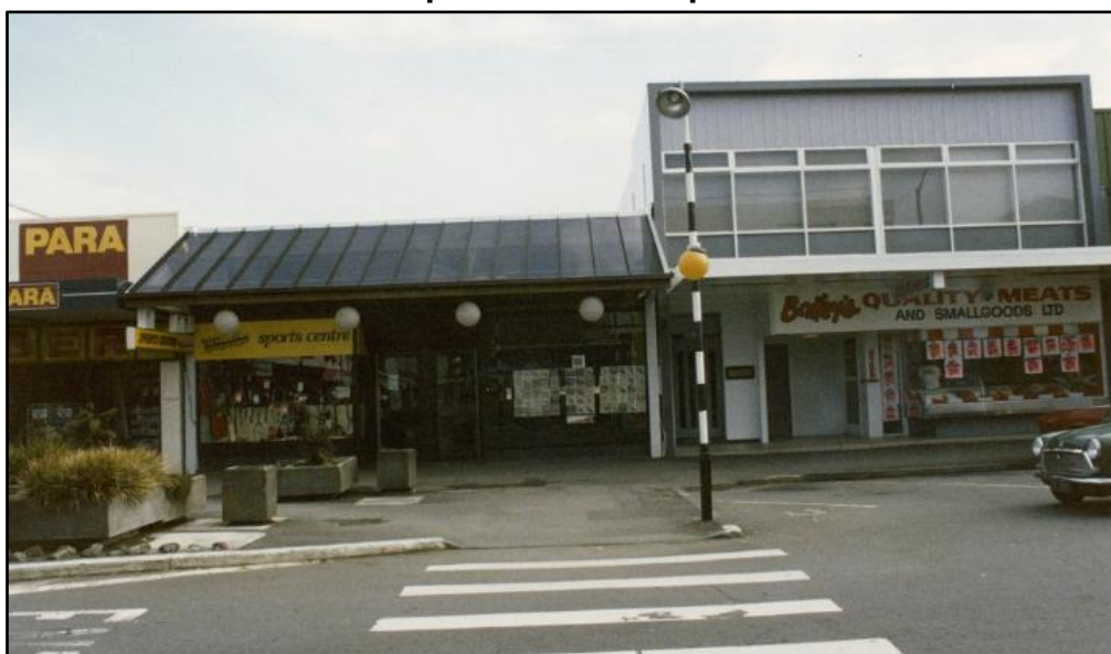
(Reference Upper Hutt City Library Recollect Main Street 1989 Tisdalls Sports Centre & Bailey's Meats P2-850-1995)

Description Sports Centre and Bailey's Meats shop fronts, Main Street - Baileys moved to 733 Fergusson Drive early in 1991, their Main Street rent had