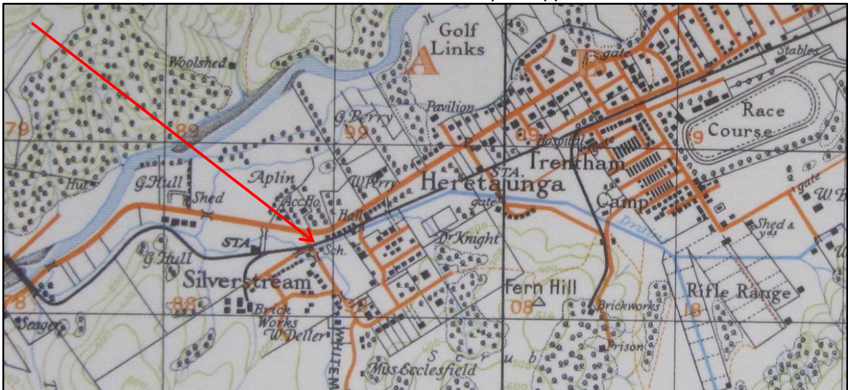
(Reference 1929 Trentham Manoeuvre Map UH MAP 1929 IMG_4595.JPG)

During the depression relief workers cleared the land and establish playing fields and gardens at Silverstream School.