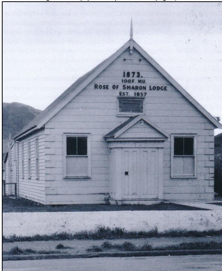
(Reference Upper Hutt City Library Heritage collection Rose of Sharon Lodge Murray Maxwell collection)

(Reference Papers past website Evening Post newspaper 26 September 1934 page 4)