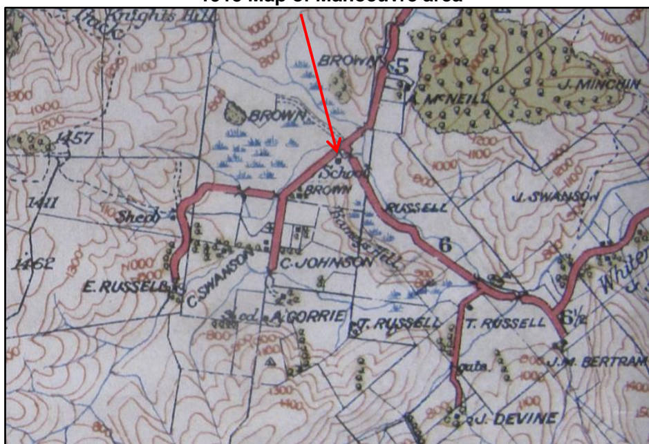
(Reference Map of Manoeuvre Area Neighbourhood of Trentham Camp 1915 saved as UH Map1915 IMG_4593.JPG)