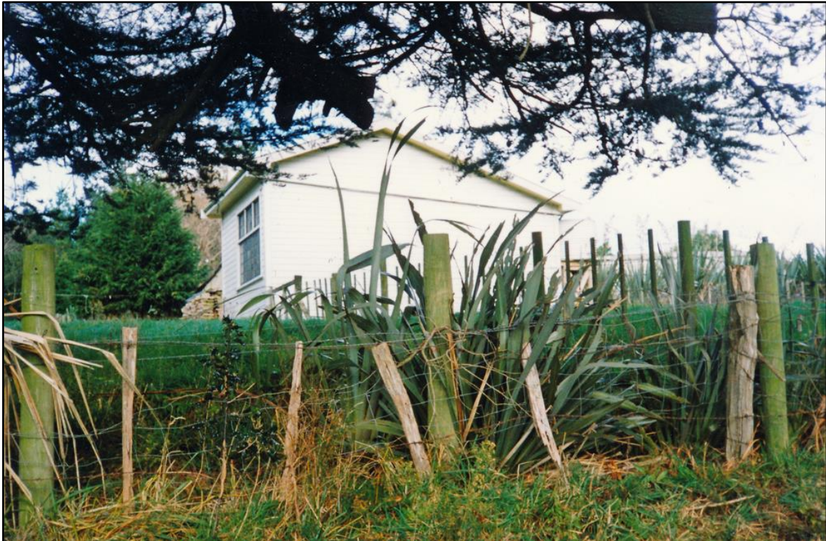
(Reference Upper Hutt City Library Heritage collection Recollect website Kay Ruscoe collection)