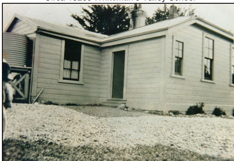
Circa 1920s Whiteman's Valley School