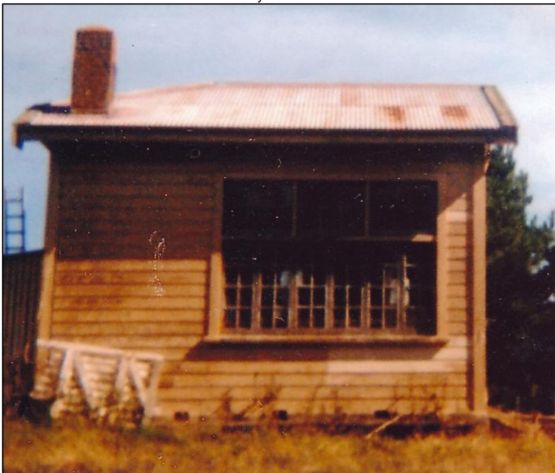
Whiteman's Valley School – date unknown