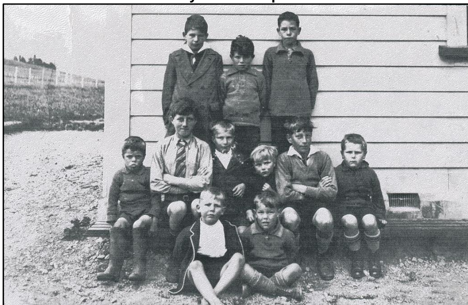
(Reference Upper Hutt City Library Heritage collection Recollect website Kay Ruscoe Collection)

Hutt Valley Independent newspaper 15 March 1913