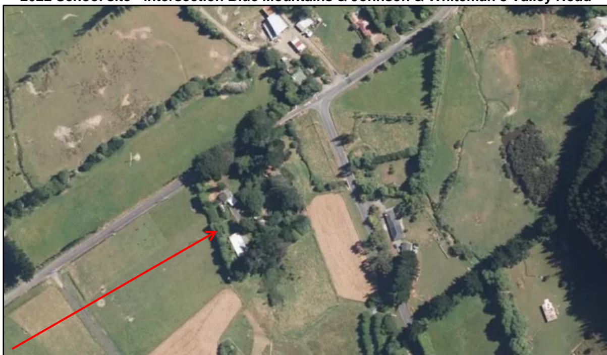
(Reference maps past website LINZ Land Information New Zealand Airphoto)