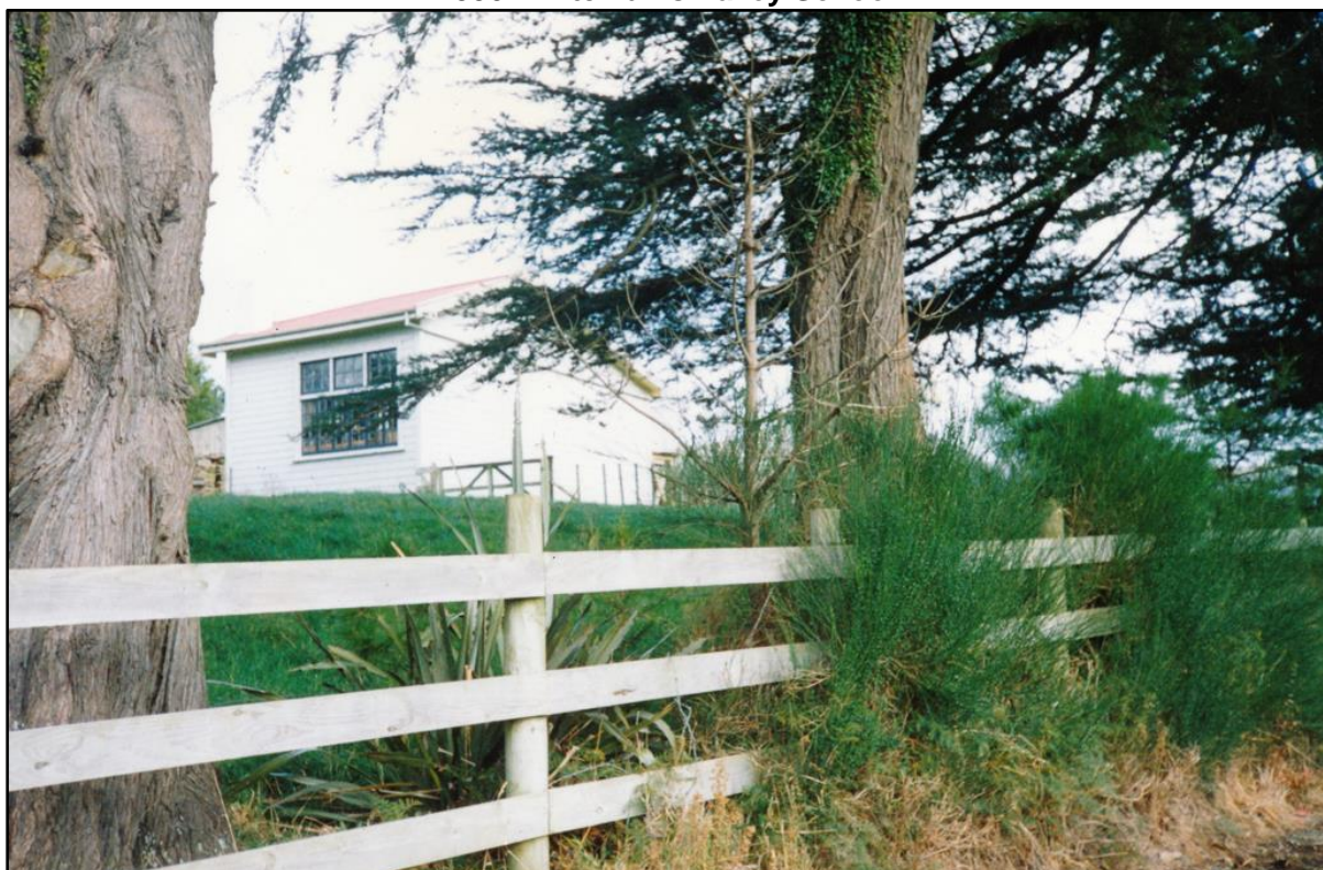
(Reference Upper Hutt City Library Heritage collection Recollect website Kay Ruscoe collection)