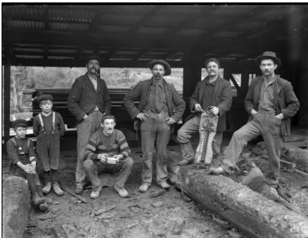
(Reference Digital NZ National Library NZ ca1908-1910 Akatarawa perhaps Baigents sawmill 1/1-019994-G)