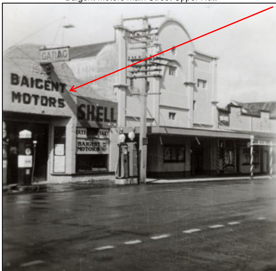
(Reference Upper Hutt City Library Recollect website Main Street Baigent Motors 1948 Sylvia Williams collection)