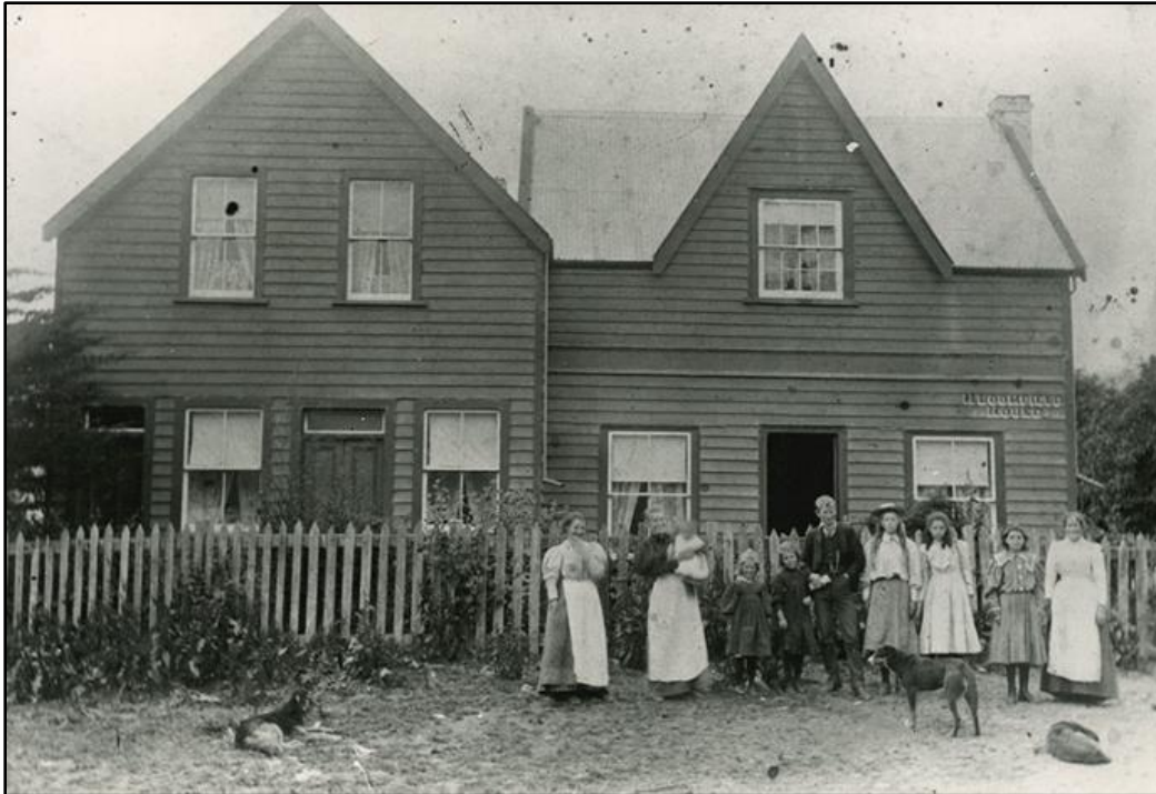
(Reference Upper Hutt City Library Recollect website Old House Te Marua Bloomfield House P3-9-31)