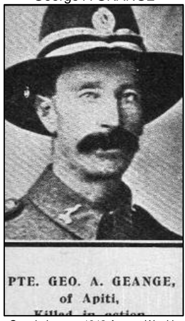
(Reference Google Images 1918 August Weekly newspaper)