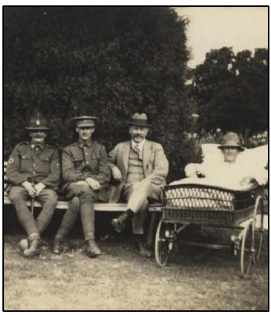
(Reference Private collection sent by email with no source)