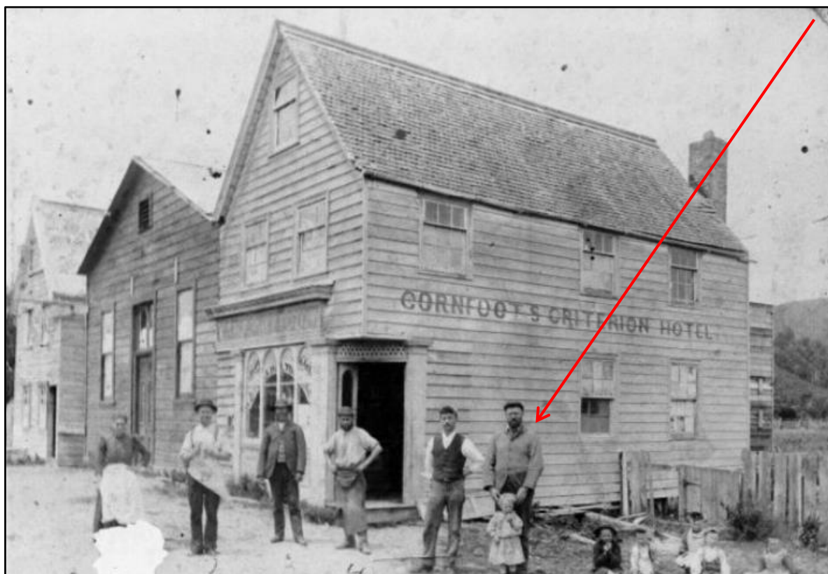
(Reference Upper Hutt City Library recollect website Criterion Hotel P5-87-804)