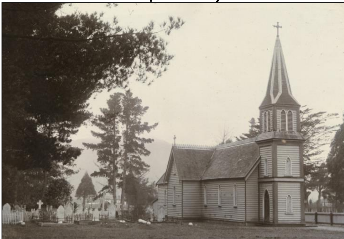
(Reference UH City Library Recollect website St Joseph's Catholic Church P4-54-640)

St Joseph's Church is situated on the corner of Pine Avenue and Main Street in Upper Hutt.