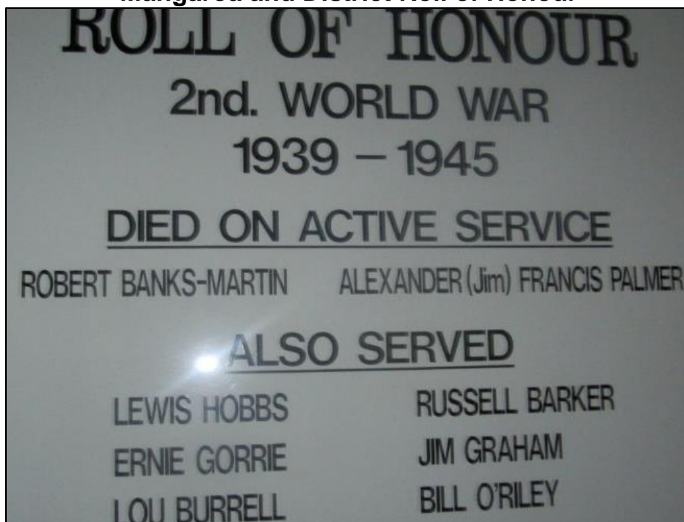
(Reference Photograph private collection Mangaroa and District Roll of Honour)

The Mangaroa and District Roll of Honour for World War Two records the names of two [2] service personnel who died while serving and the names of six [6] service personnel who served and were discharged after the war.