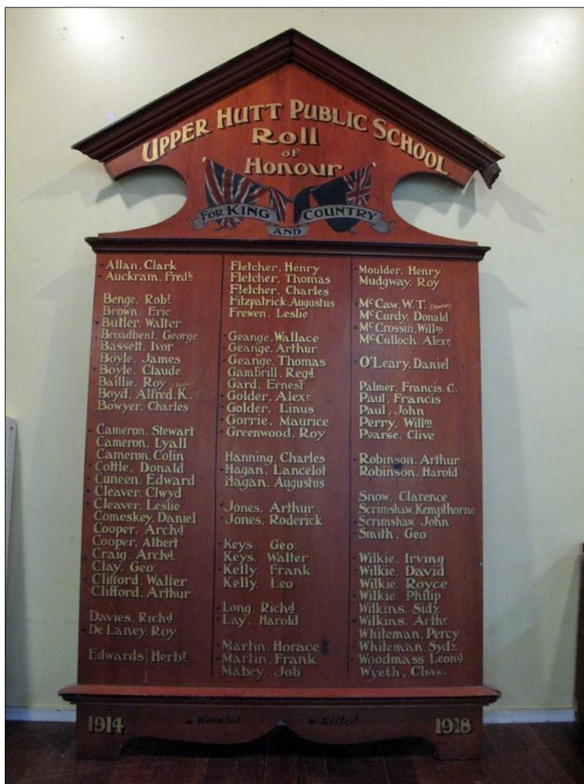
(Image photographed inside the Upper Hutt School Hall Martin Street Upper Hutt source Private collection)

The Upper Hutt Public School did not create a World War Two Roll of Honour Memorial board.