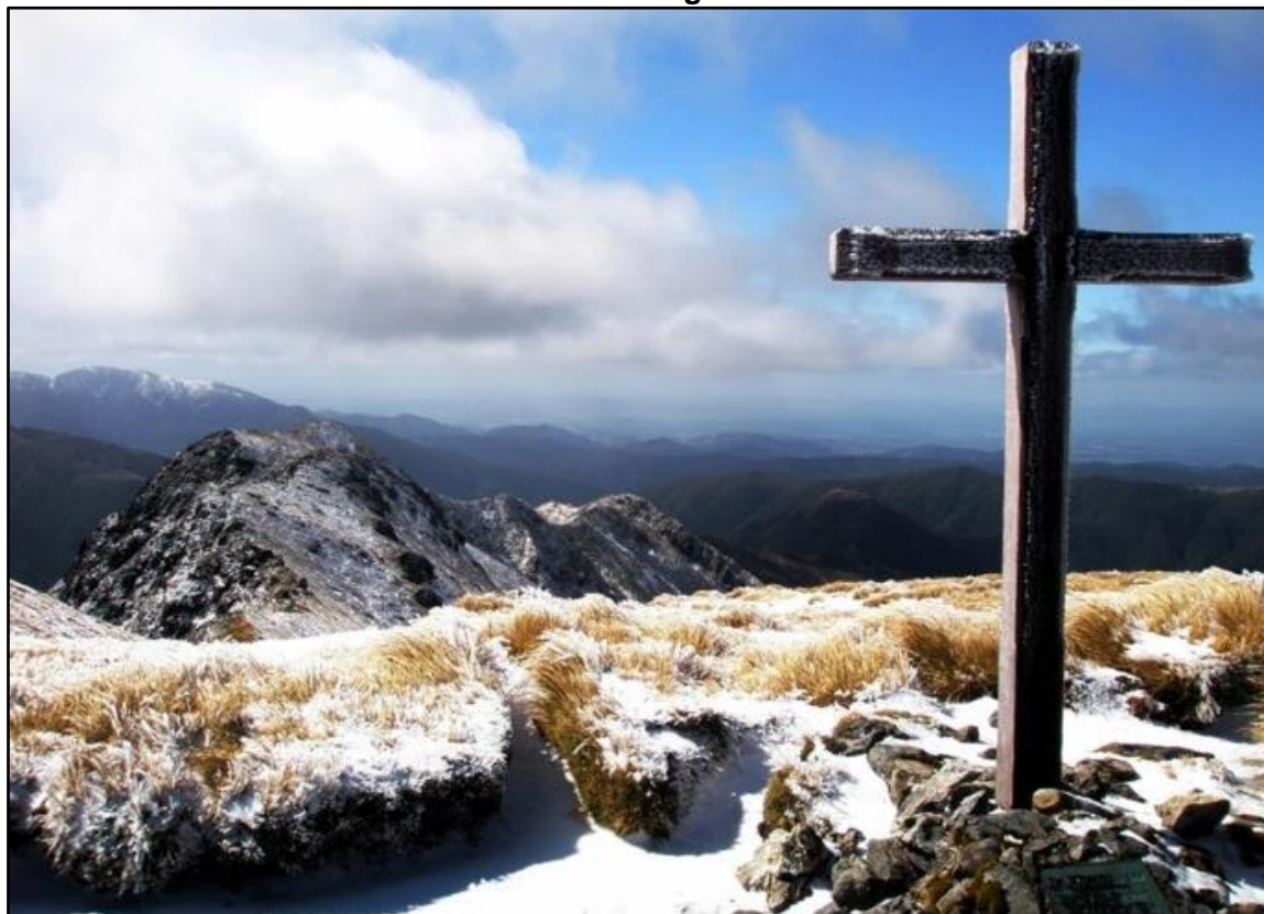
(Reference New Zealand Trumper website Mt Hector war memorial)