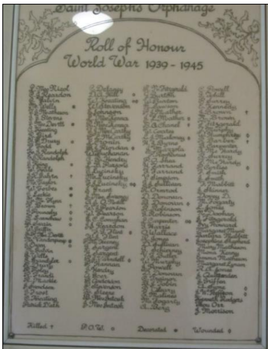
(Reference Photograph private collection Saint Joseph's Orphanage Roll of Honour World War 1939-1945)

There are one hundred and fifty five [155] service personnel names recorded on the Roll of Honour and include the names of four [4] who died while serving during World War Two.